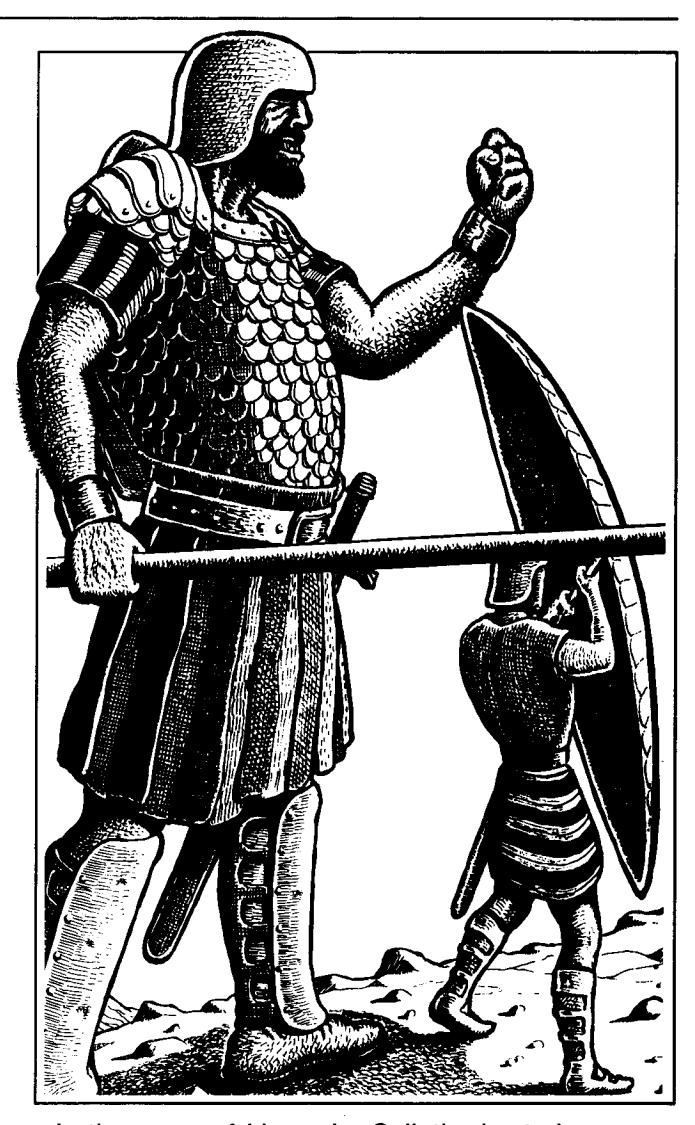
In the name of his gods, Goliath shouted curses and threatened to feed David's dead body to the birds and beasts.

What was David's reply to Goliath? (Summarize I Samuel 17:45-47.) David, with his youthful ability and