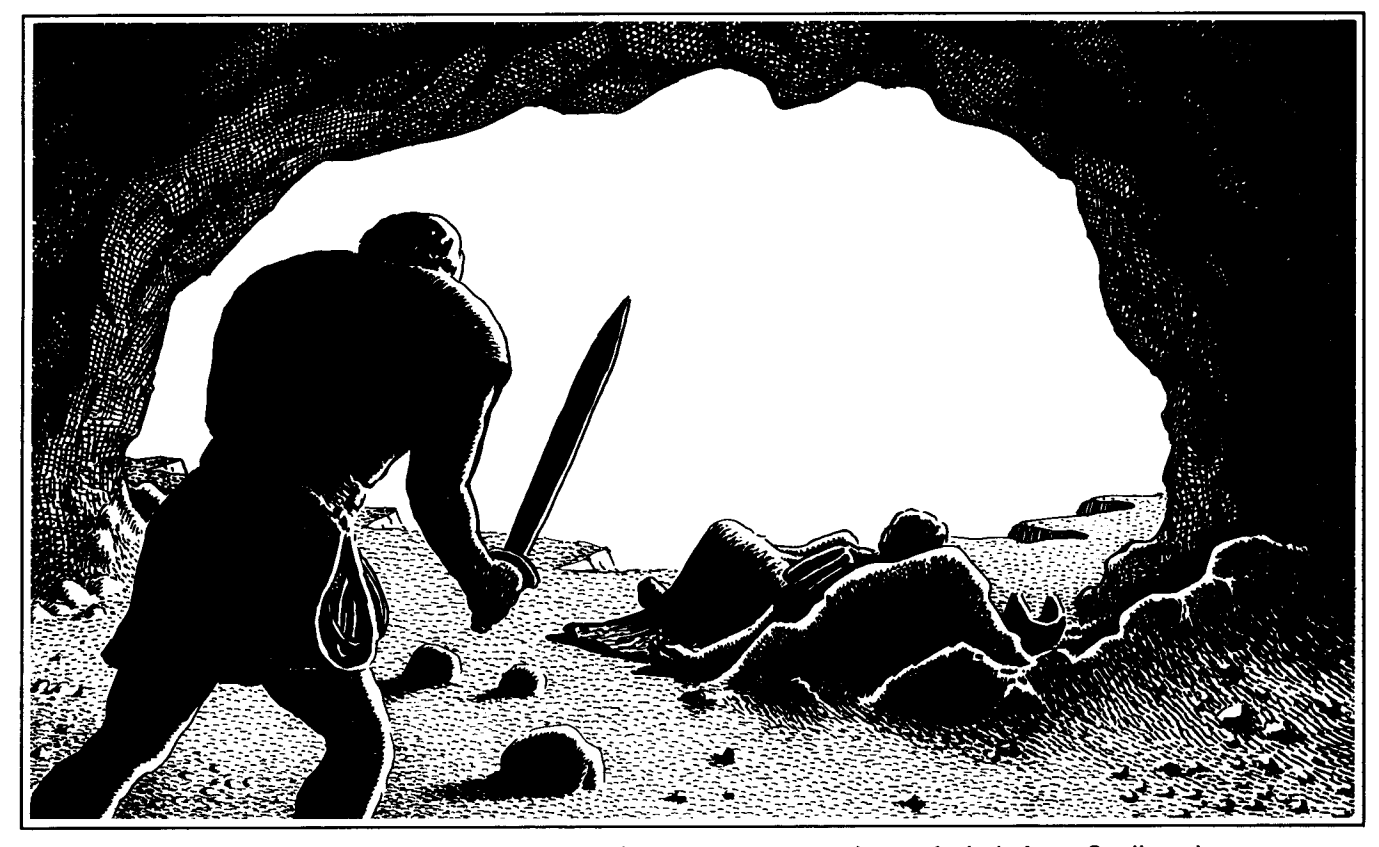
David quietly crept from the back of the cave to cut a piece of cloth from Saul's robe.

We can see from Saul's example how dangerous anger and jealousy can be. It is important that we all learn to control our tempers and emotions. Many people have been hurt or killed because of jealousy and hatred. We should try to follow David's example, and not the example of King Saul.