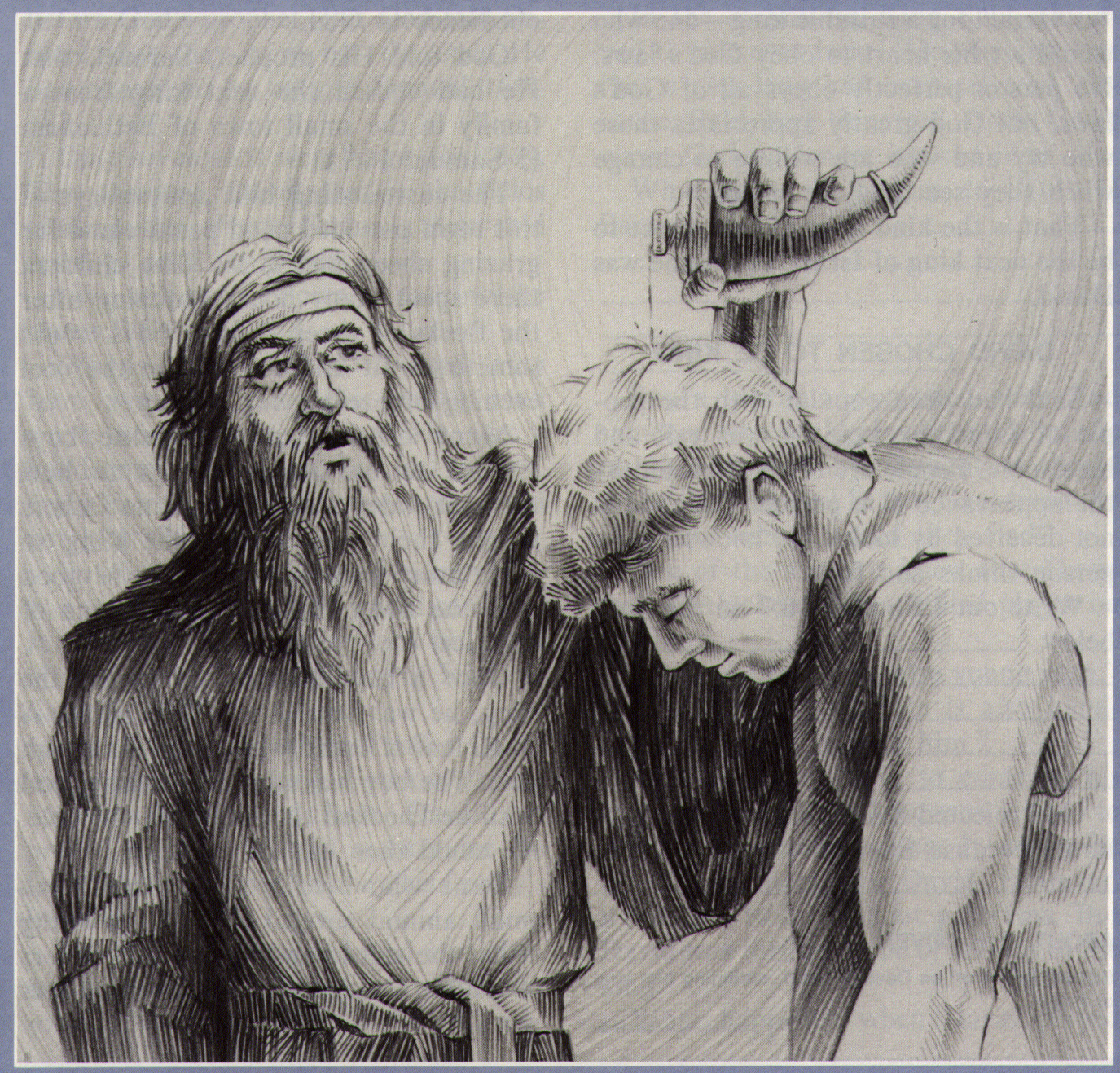
David Is Anointed King of Israel