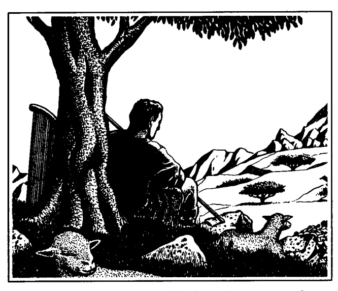
David returned from the king's palace to continue caring for his father's sheep.